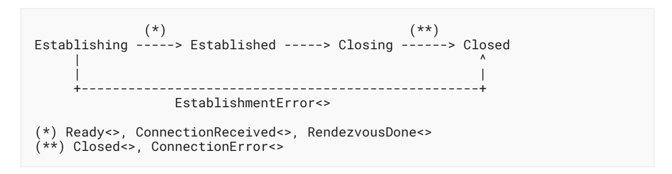
Figure 2: Connection State Diagram

The Transport Services API provides the following guarantees about the ordering of operations: