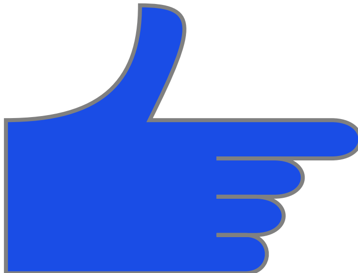
Figure 2-33: the finished hand, filled

Note that the "stroking" of the border draws over the interior fill where they overlap.